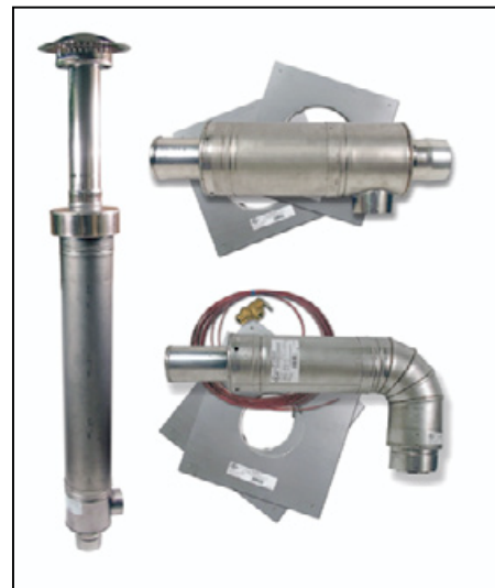
RHEEM DIRECT VENT KIT FOR DIRECT VENT MODELS

Rheem Manufacturing Company ( www.rheem.com ) is a privately held company with headquarters in Atlanta, Ga. In its 81st year of operation, the company manufactures a full-line of high-quality residential and commercial heating and cooling systems, water heaters, swimming pool heaters and commercial boilers throughout North America and world markets. The premium brands of Rheem Manufacturing Company include Ruud, Raypak and Rheem. Rheem Manufacturing Company is the major associate sponsor of Richard Childress Racing and the No. 29 team driven by Kevin Harvick, 2007 Daytona 500 Champion, 2007 Craftsman Truck Series Champion and 2006 Busch Series Champion. Rheem is also the primary sponsor of Kevin Harvick Inc.'s No. 33 and No. 77 car for four high-profile Nationwide Series races in 2008.