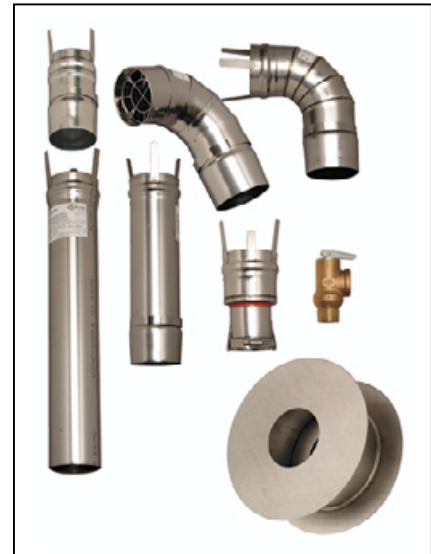
RHEEM HORIZONTAL VENT KIT FOR POWER VENT MODELS